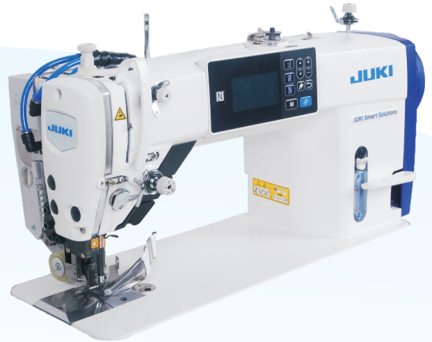
GPB-2 Puller Attachment (for lockstitch) JUKI DDL-8700 /DDL-9000